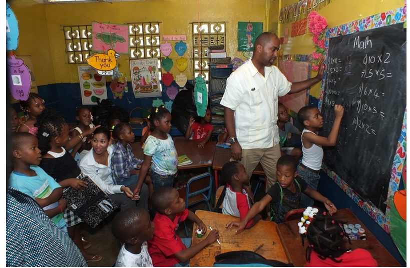
Nannyville Summer Camp