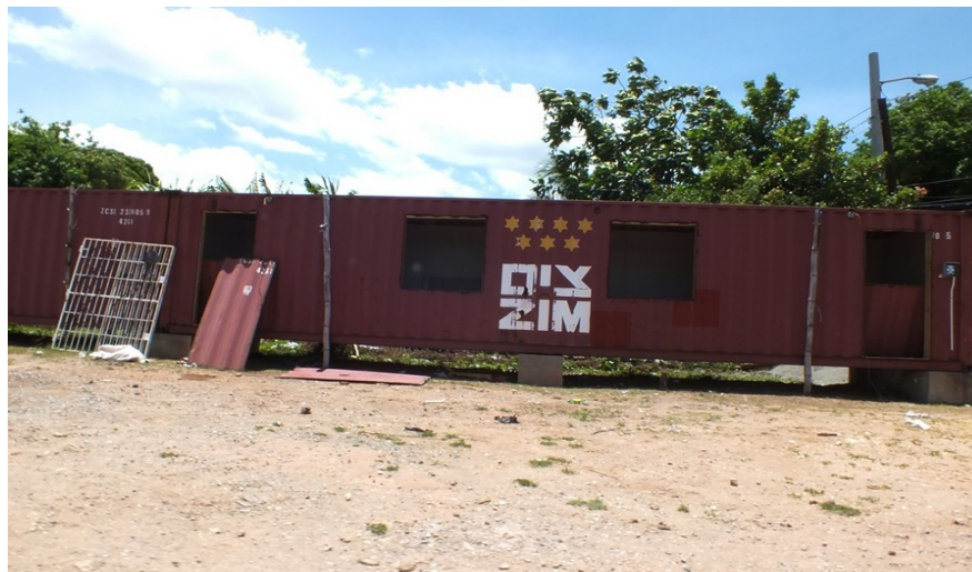
Container being worked on at the Jacques Road community centre