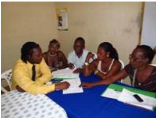
Participants in the parenting workshop