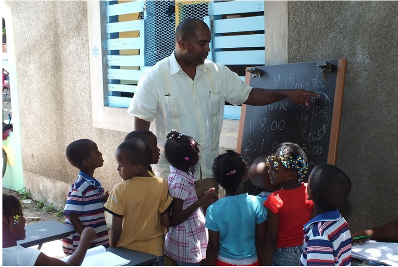
Jacques Road Summer Camp