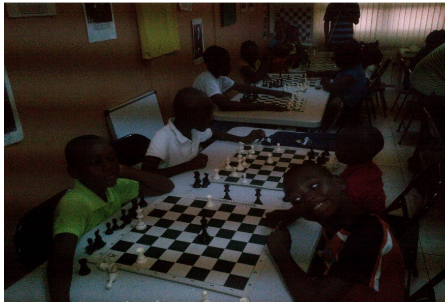
Students at the chess training program